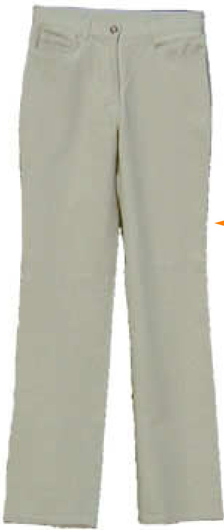
SX-025 16W Elastic Pants

Fabric: 97% cotton, 3% spandex 16w corduroy of spandex weft.