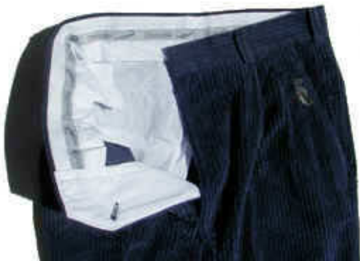
SX-014 4W Corduroy Pants